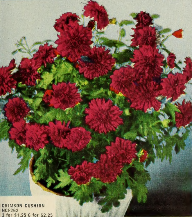
CRIMSON CUSHION NCF262 3 for $1.25 6 for $2.25